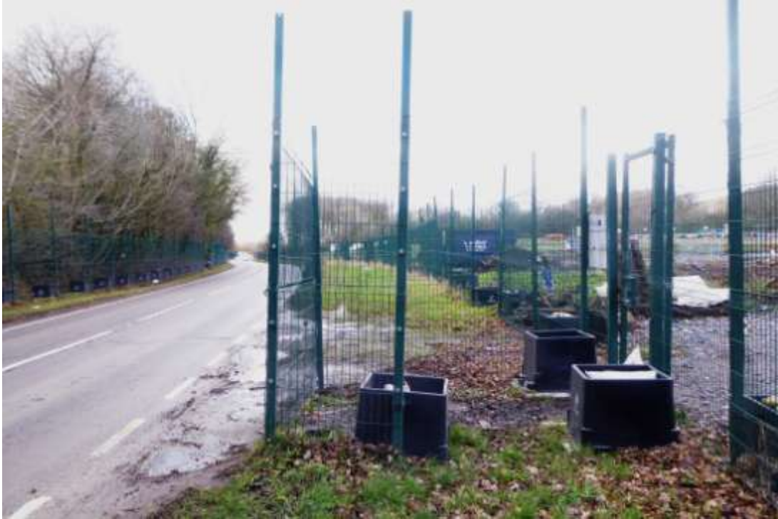
The East side walkway is generally much wider, apart from a few obstacles..