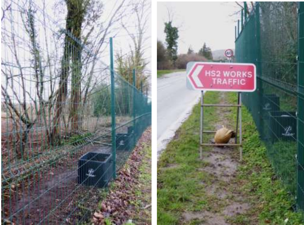
West side – the security fencing, constructed on the existing footpath; further gratuitous obstruction of the limited space remaining, by a roadsign