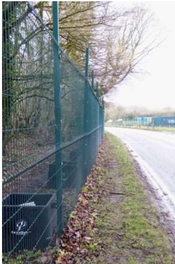
West side, showing footpath now behind the security fence, and the narrow gap remaining for pedestrians