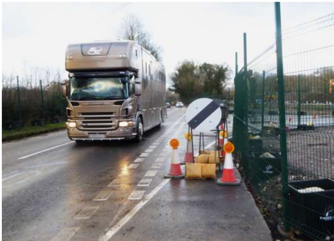
Such as this carelessly positioned road sign