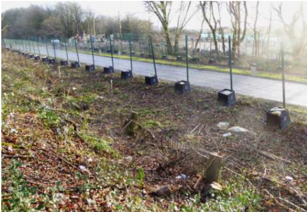
The security fence is 2 to 3 metres inside the railings marking the edge of the highway.