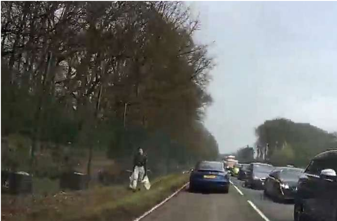
A pedestrian negotiating the narrow path alongside the carriageway

Following the eviction of the Wendover Active Resistance camp from land between the A413 and the Chiltern Line (just south of Grove Farm), HS2/EKFB erected fencing to secure the area, in violation of section 137 of the Highways Act 1980, and so a criminal offence.